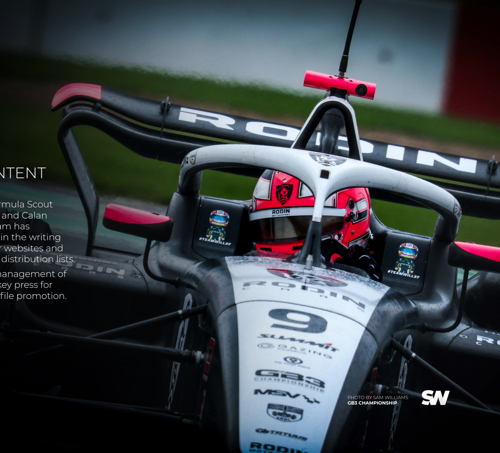
GB3 CHAMPIONSHIP