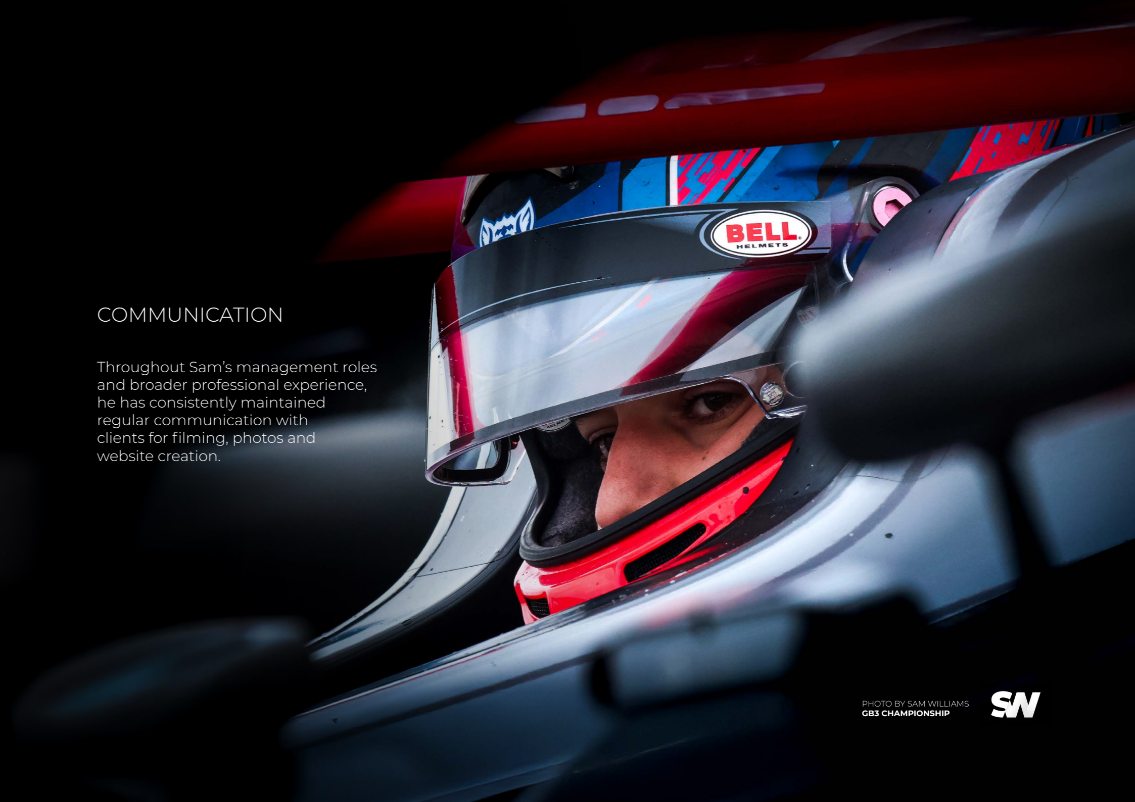
GB3 CHAMPIONSHIP