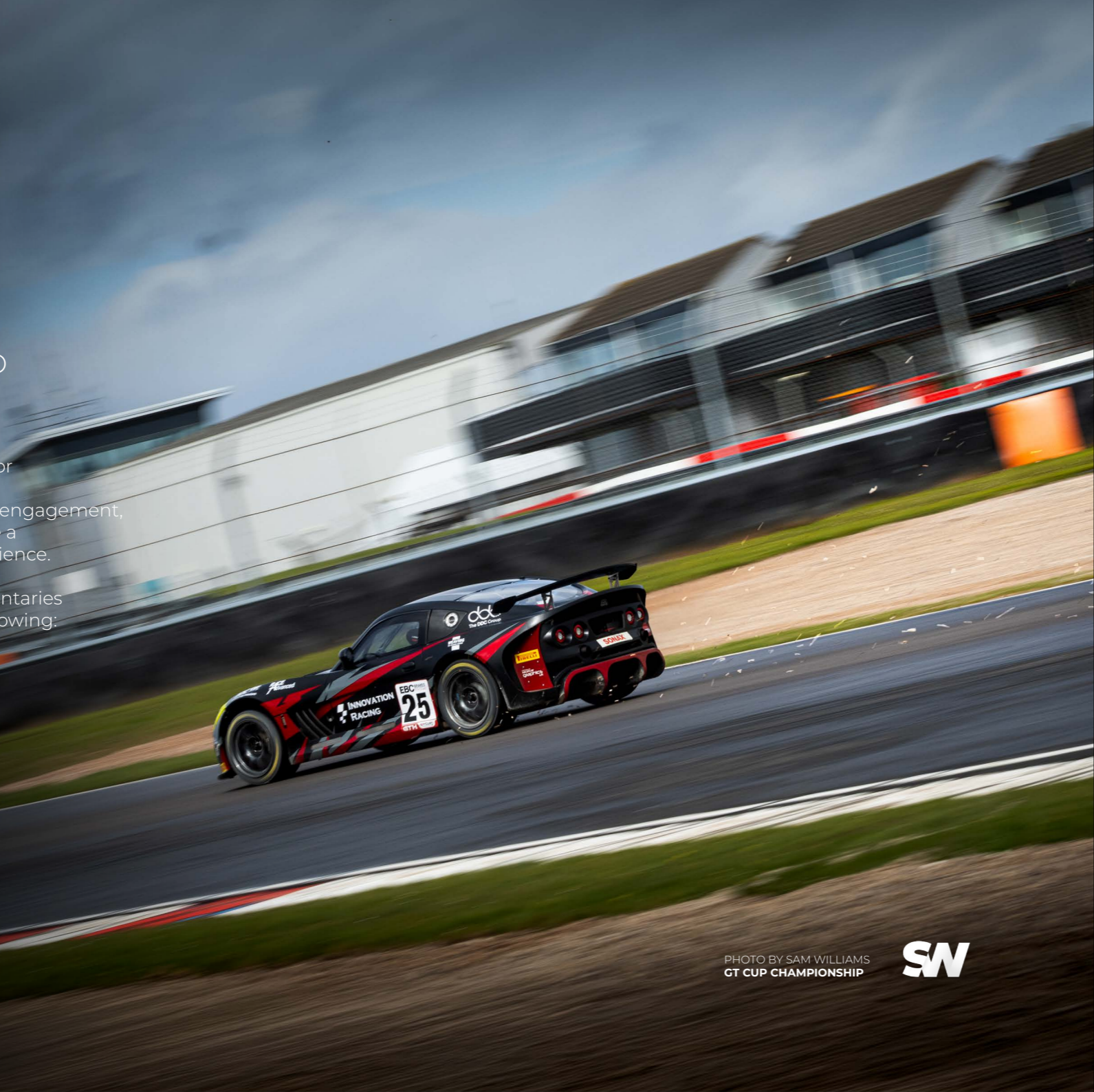
GT CUP CHAMPIONSHIP