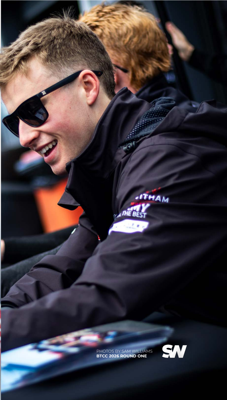
BTCC 2026 ROUND ONE